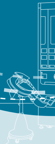
T-ROLLY + ATDPS