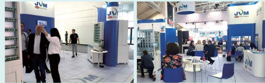
ExpoPharm 2018, Munich, Germany

Many visitors were interested in JVM's pharmacy automation solution and signed up for further information. Existing customers also visited the booth to learn about JVM's new products and say a hello. Among many products displayed at the show, NSP was the most popular product that grabbed many attentions. NSP, New Slide Premier, is JVM's newest ATDPS (Automated Tablet Dispensing and Packaging System) model that inspects tablets before packing into pouches. The internal inspection function increases accuracy and maximizes efficiency.