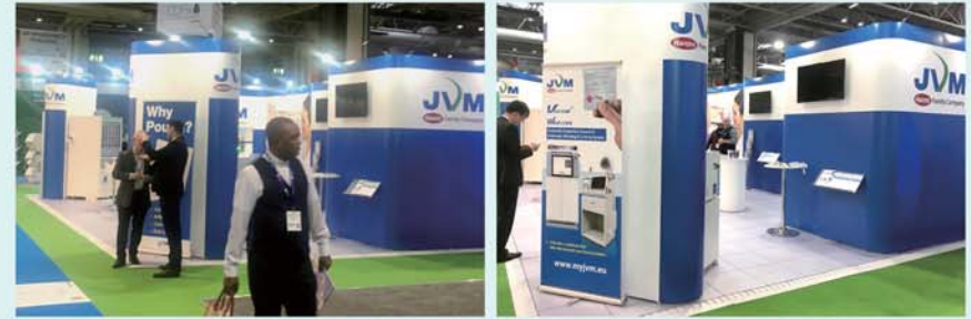
Pharmacy Show, Birmingham, UK