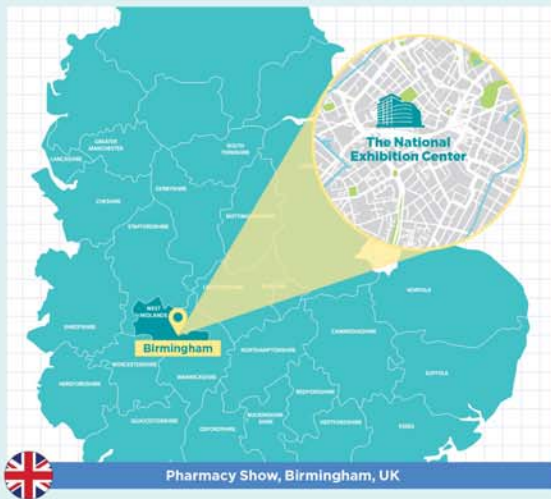
Pharmacy Show, Birmingham, UK

JVM's booth was full of crowds for two full days. This year, the Pharmacy Show was held in the National Exhibition Centre located in Birmingham, UK, from Sunday, October 7th to Monday, October 8th. More than 400 companies and organizations participated, as the show has been well known as the biggest pharmacy show in the UK. Visitors' occupations were quite diverse, ranging from a student to a pharmacy contractor, dispenser, and pharmacists. Sponsored by NHS, National Health System, the show was successful, and JVM also was able to engage with many customers successfully.